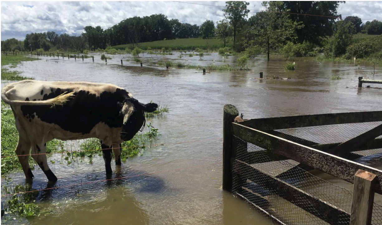
A massive rain event inundated the farm in the summer of 2023.

diverting rainwater there acted as a temporary holding tank that could be filled and refilled again. The berms also helped divert flood waters coming onto their property from a neighboring farm that has less permeable soils.