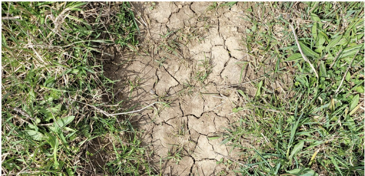
Drought conditions have become the normal for summers at Pittsburgher Highland Farm.

The trend at the farm over the past 10 years has been increasingly low rainfall. Smith says six of the past ten years have been very low, to the point where his creeks dry up, and grass production is poor. In addition to having to pay for supplemental feed, Smith spends half his day hauling water to one farm site or another—a huge time sink and hard labor.