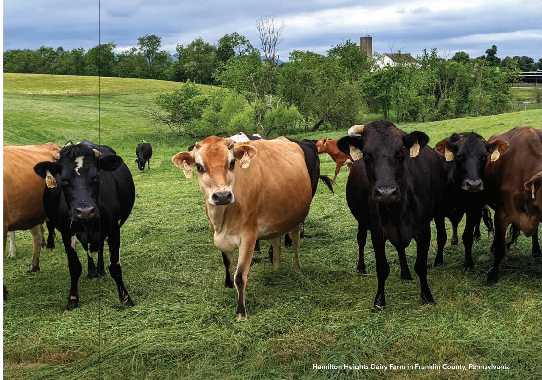
Hamilton Heights Dairy Farm in Franklin County, Pennsylvania

We've forged partnerships across the Mid-Atlantic and Northeast to help local farmers benefit from and grow this movement. From experienced graziers seeking a better price for their milk, to conventional farmers only beginning to think about how grazing might support their operation, our Dairy Grazing Project is helping farmers learn from one another about best practices for managed grazing and find a more secure path toward financial viability.