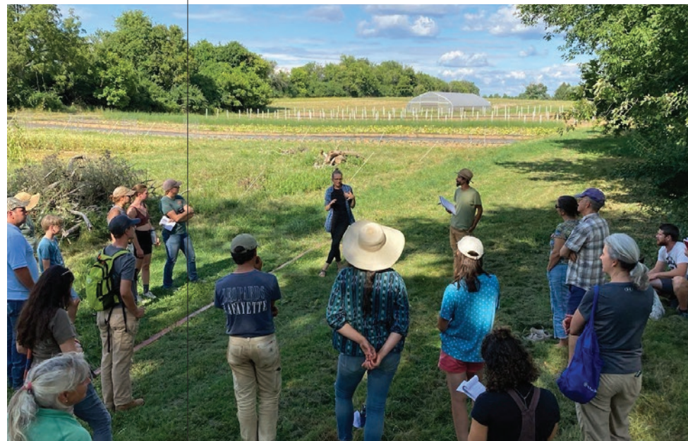
Farmers interested in agroforestry gather for a field day at Good Work Farm in Northampton County, Pennsylvania, one of three farms serving as demonstration sites for the benefits of alley cropping in the state.