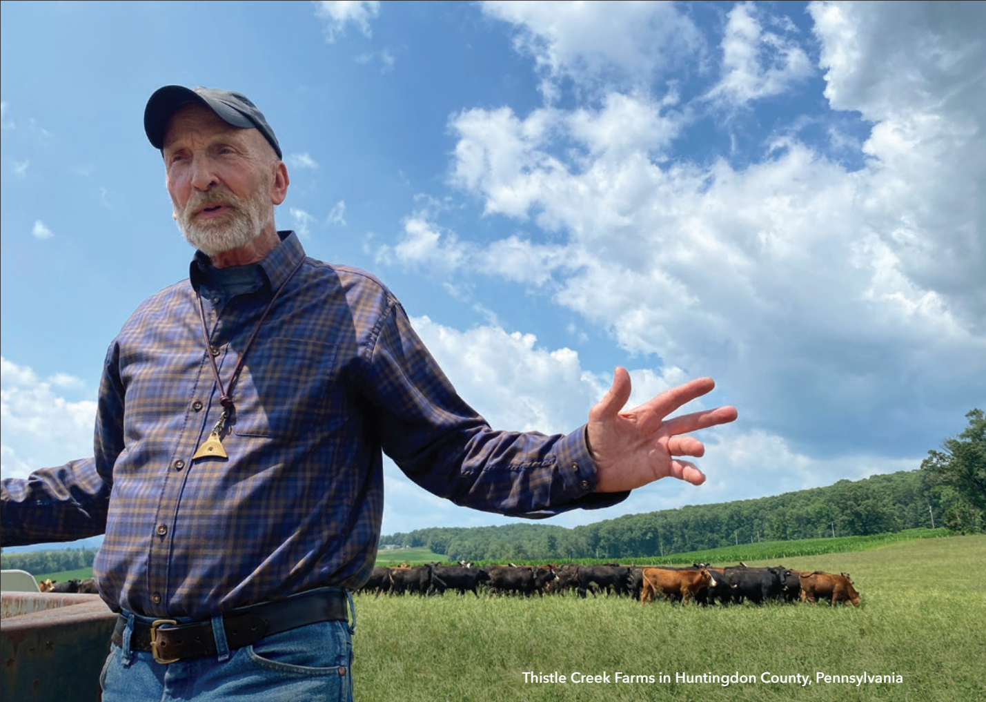
Thistle Creek Farms in Huntingdon County, Pennsylvania