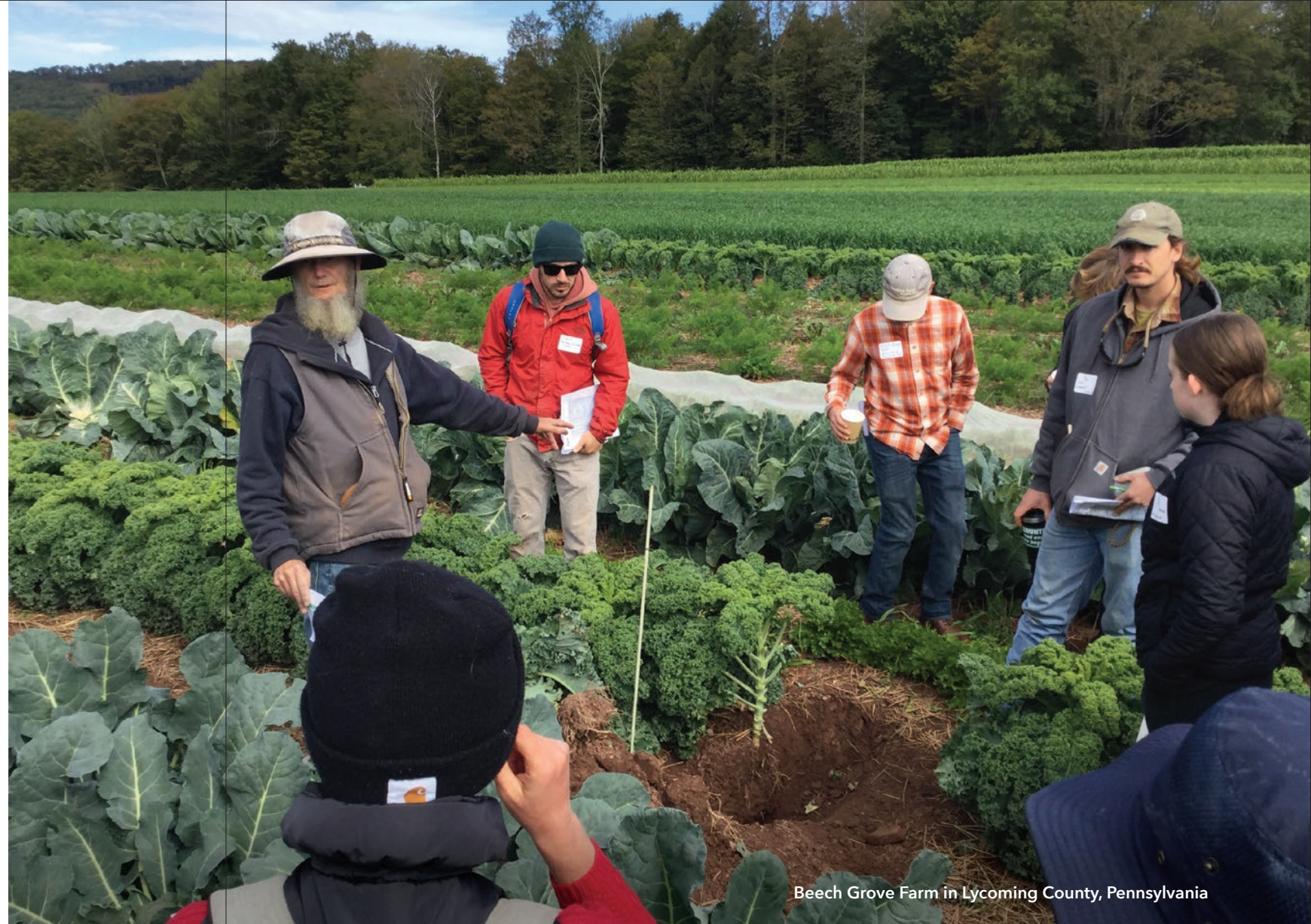
Beech Grove Farm in Lycoming County, Pennsylvania