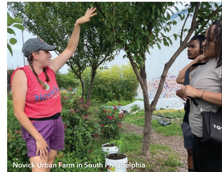
Novick Urban Farm in South Philadelphia