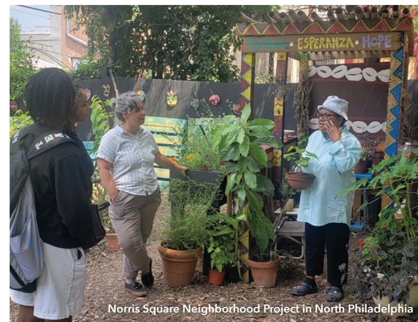
Norris Square Neighborhood Project in North Philadelphia