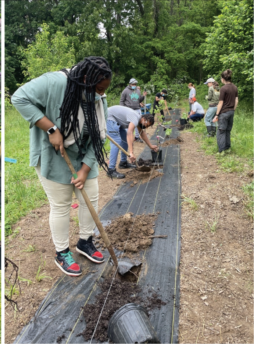
Weavers Way Farms' alley cropping plan involves adding perennial veggies to boost productivity on their existing urban orchard in Northwest Philadelphia. They're also expanding their lineup of popular fruit tree varieties.