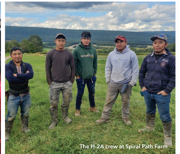
The H-2A crew at Spiral Path Farm