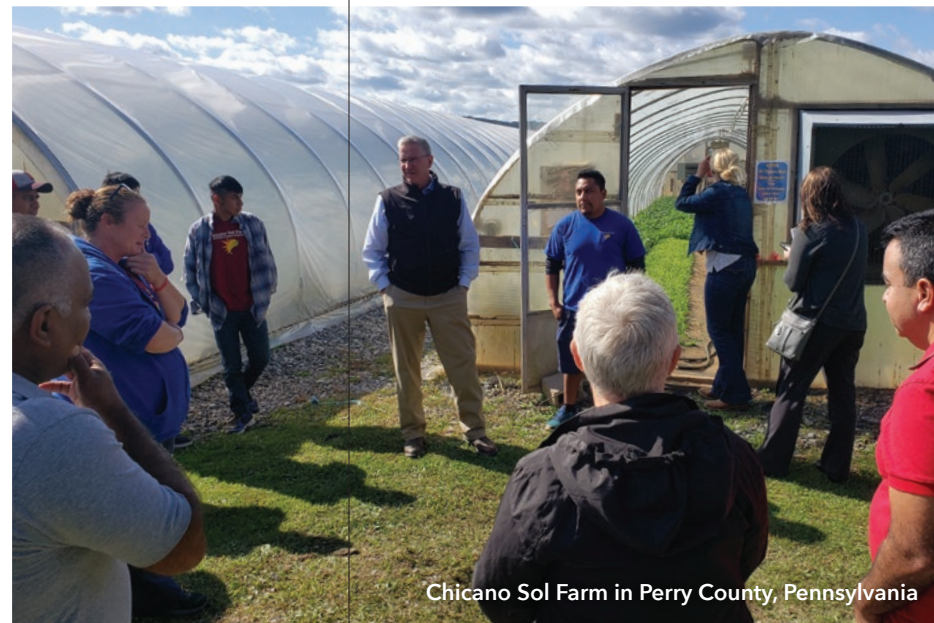
Chicano Sol Farm in Perry County, Pennsylvania

Pasa staff along with Pennsylvania legislators and officials hear from the crew at Spiral Path Farm